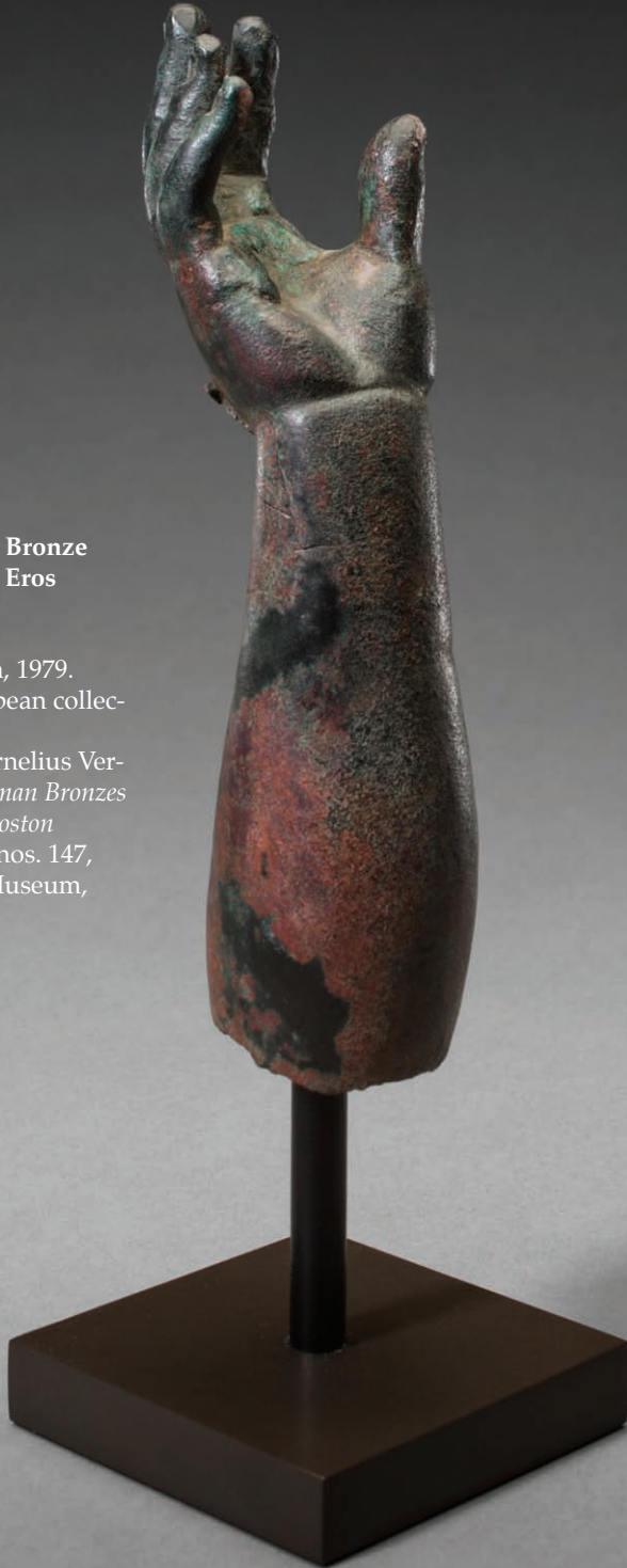
The Right Arm of a Roman Bronze Statue of a Child, probably Eros 1st-2nd Centuries AD length: 5 7/8 in. (15 cm.) (private American collection, 1979. More recently, private European collec- tion, 1990's-2016) [cf: Mary Comstock and Cornelius Ver- muele, Greek, Etruscan & Roman Bronzes in the Museum of Fine Arts, Boston (Boston, 1971), pp. 130-131, nos. 147, 148; and The J. Paul Getty Museum, Malibu, acc. no. 96.AB.53