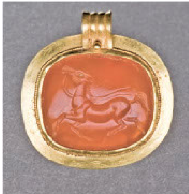
Hellenistic Cornelian Intaglio of a Horse in later Roman gold bezel 1st Century BC

ht: 1 7/16 in. (3.7 cm.) w: 1 3/8 in. (3.5 cm.) (private European collection, 1981)